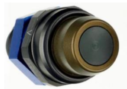
Receiver vehicle side Z-Q 0001 8034